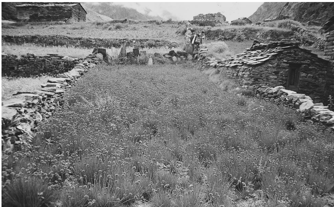
FIGURE 3 Cultivation of Pharan ( Allium carolinianum ) on an agricultural field.

centuries (Atkinson 1882). They are propagated through bulbs and their leaves are harvested twice a year, during June–July and September–October. However, the commercial cultivation of medicinal herbs in the villages studied is a relatively recent development that began about 5 years ago.