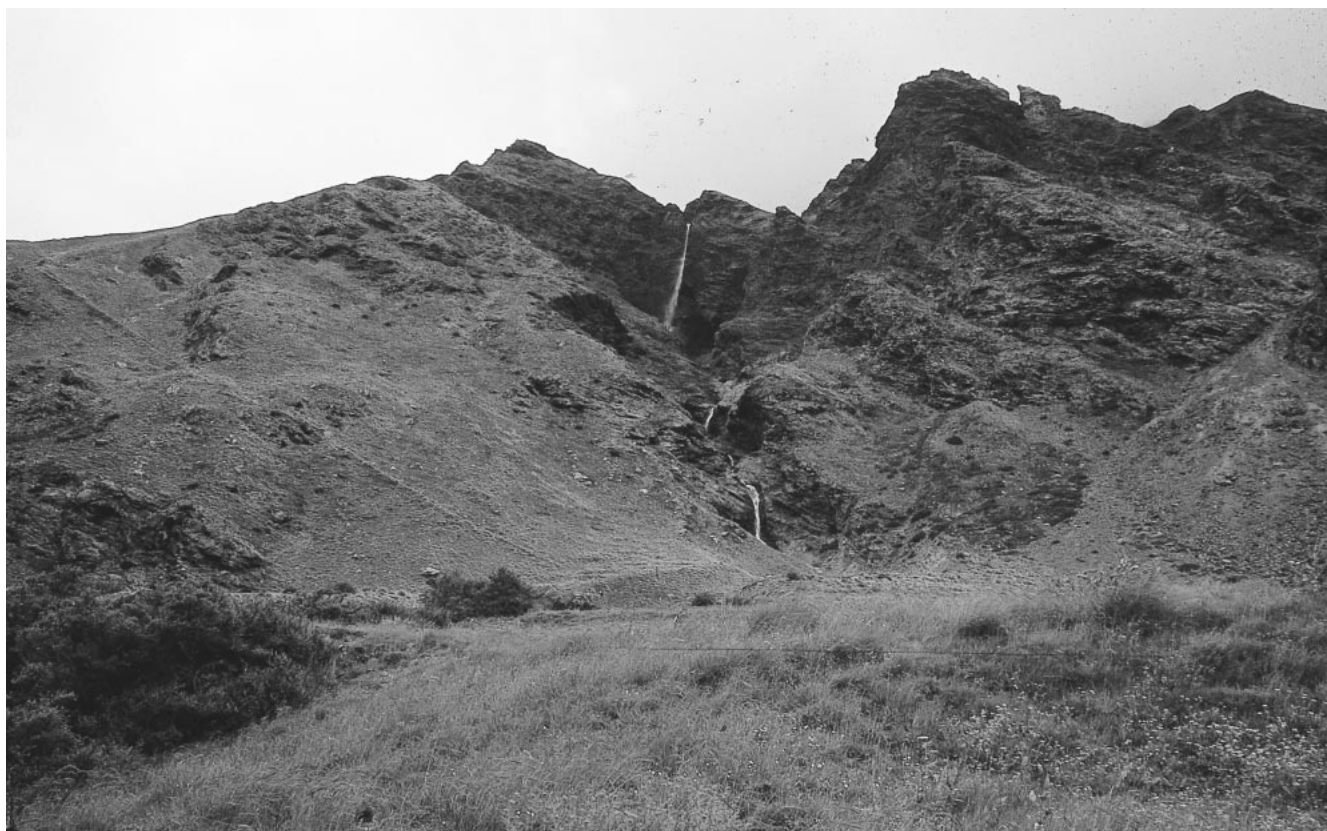
FIGURE 2 Alpine meadows above the timberline contain a great variety of flowering plants, including medicinal herbs.

Recently, rearing sheep and goats, practicing agriculture on marginal lands, and the production and sale of woolen articles have been major occupations among the Bhotiya .